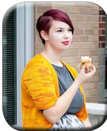
Depoe Bay Shrug by Kay Hopkins