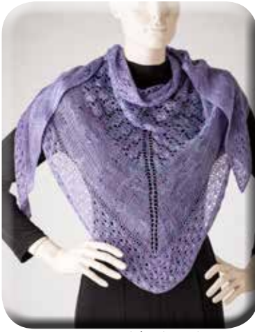
Obi Shawl by Fickle Knitter