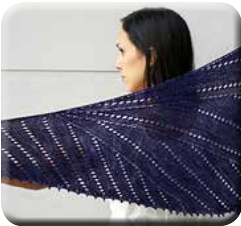
Imagine When* by Joji Locatelli