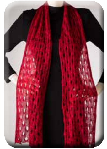
Gnomes by Fickle Knitter