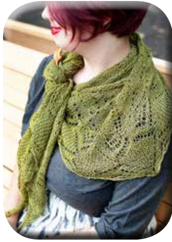
August KAL by Fickle Knitter