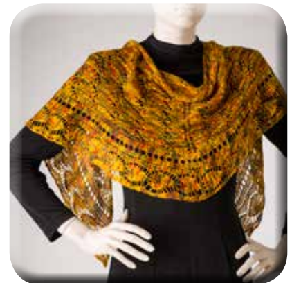
Fly Leaf Shawlette by Fickle Knitter