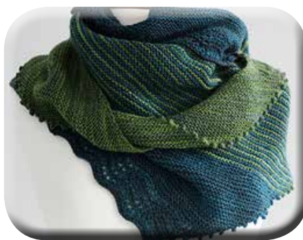
Zephyr Cove* by Rosemary (Romi) Hill